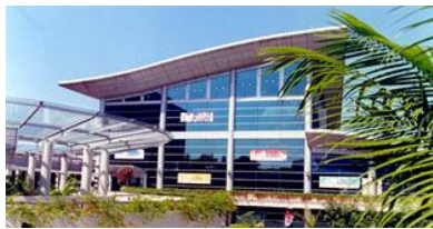
The Nanyang Auditorium

Through its 12 schools organised under a four-college structure, and two autonomous entities, the National Institute of Education and S Rajaratnam School of International Studies, NTU provides a high-quality global education to more than 20,000 undergraduates and 8,700 graduate students. The student body includes top scholars and international olympiad medallists from the region and beyond.