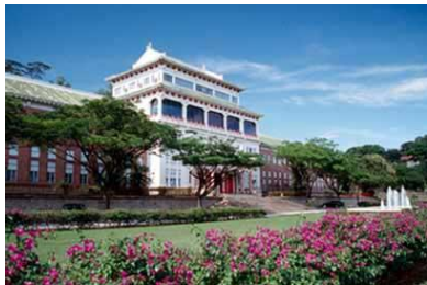
The Chinese Heritage Center

Nanyang Technological University (NTU) is a research-intensive university with globally acknowledged strengths in science and engineering.