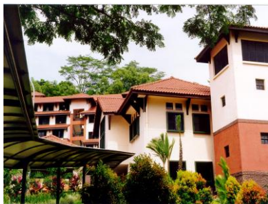
Hall of Residences

The university's College of Engineering has six schools focused on technology and innovation, and is one of the world's largest engineering colleges.